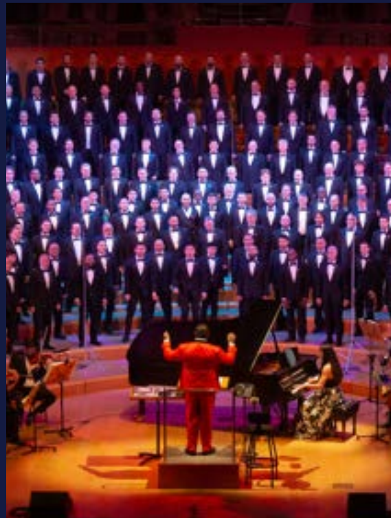
Gay Men's Chorus of Los Angeles